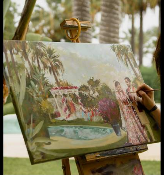
Marbella, 2019 photos: Sikh and Dread