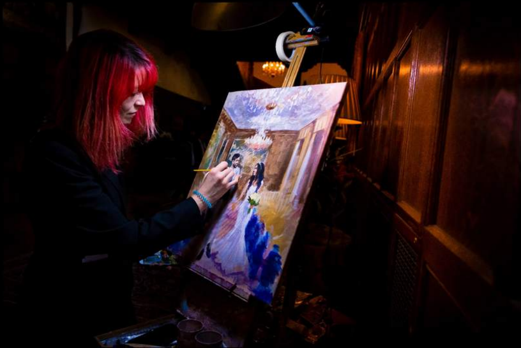
North Mymms Park, 2021

I will not engage in any marketing or business practices which are demonstrably wasteful, and seek to use all resources with care and efficiency.