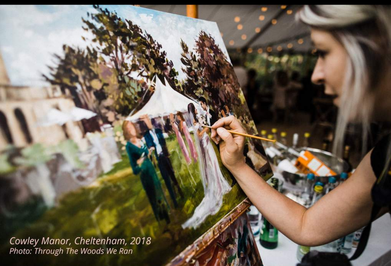
Cowley Manor, Cheltenham, 2018

If you want a painting which captures guests as well as the couple, then you are looking for an event painting. You can tell me which people you would like in the painting so that I can include your most important guests prominently. I ask you to arrange for me to meet your key guests early in the event for a quick reference photo so that I can identify them and paint the correct people!